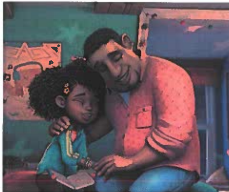
Netflix's upcoming animated series, "Karma's World" is inspired by the eldest daughter of rapper/creator Chris "Ludacris" Bridges.

sively reveal that the animated feature, "The Mitchells vs. The Machines," due April 30, will feature the voices of Chrissy Teigen, John Legend, Conan O'Brien, Beck Bennett and Fred Armisen, in addition to leads Abbi Jacobson and Danny McBride. In the film, a dad (McBride) decides to make dropping daughter Katie (Jacobson)